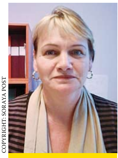
Fighting for Roma women's rights: Soraya Post

But there is something else which needs to be taken into account, the fact that many Roma, and in some countries