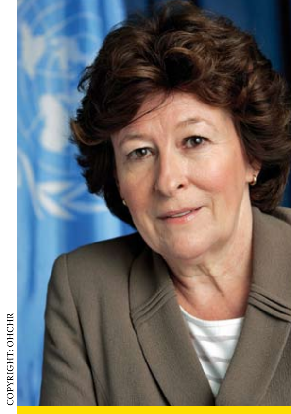
Louise Arbour, UN High Commissioner for Human Rights

Another equally important step is putting in place and enforcing strong and comprehensive anti-racism and anti-discrimination legislation encompassing appropriate penalties for violations. Governments take different approaches to legislation, one of which is to adopt genderspecific legislation and protection mechanisms. Another is to incorporate strong gender provisions within specific pieces of legislation, such as education or labour law. We do need to see more countries adopting stronger anti-discrimination legislation generally. However, importantly, we need to ensure that legislation